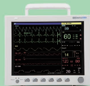
iM8 VET series Veterinary Monitor